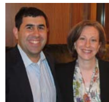
STEVEN & CHANI LAUFER Young Leadership Award

We look forward to seeing you at the dinner!