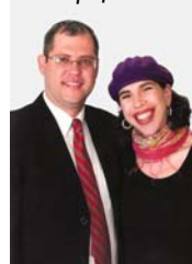
RABBI TOMER & EFRAT GROSSMAN Community Service Award